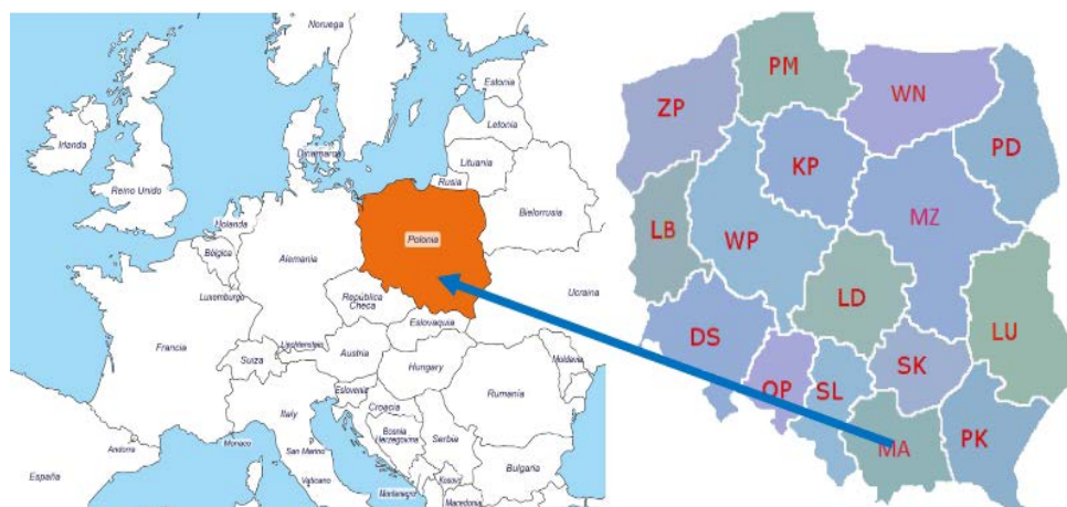
Figure 1. Location of Małopolska region in Poland (Poland in middle-eastern Europe, Małopolska southeastern Poland).

east, and Slovakia in the south (Figure 1). This region covers part of the Western Carpathians and the Małopolska Upland. Two main Polish rivers flow through its area: the Vistula and the Warta, which are the longest rivers in Poland. The capital of the region is Krakow, the second-largest city in terms of area and population, which was once the capital of Poland. In terms of administration, the voivodeship is divided into two levels: the county into 22 counties and communally into 182 communes. Analyzing the area of individual counties, the largest is Nowosądecki, at 1549 km 2 , and the smallest is Chrzanów, at 372 km 2 . It is one of the smaller regions in Poland (12th place in the country), and is fourth in terms of the number of inhabitants [22].